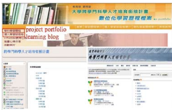
Figure 1. Homepage of the e-portfolio system.

The “learning blog” function highlighted in Figure 1 was the space for students to show their reflection, their learning activities records, learning diaries, and so on. It is also a place for social interaction. Figure 2 shows the homepage of the learning blogs. There are three main lists in this page: the latest posts, the most active blogs, and the latest created blogs. The most active blogs were ordered by the number of comments replied.